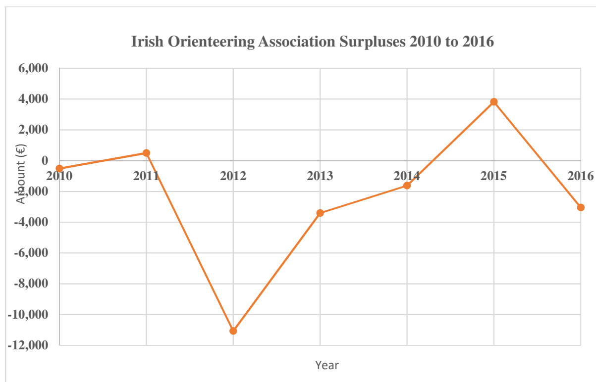
Figure 1: Irish Orienteering Association Surpluses 2010-2016